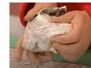
Scrunched up newspaper