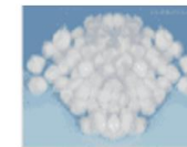
Cotton Wool Balls